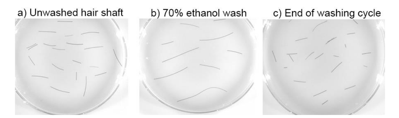
Figure S3. Evaluation of hair shafts for bacterial contamination. The hair shaft samples were incubated with LB agar in a petri dish 72 h at 37 °C and evaluated for bacterial contamination a) The hairs shafts sample before subjected to washing, b) disinfected with 70% ethanol, c) complete standard wash hair shafts.